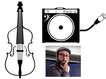
CONTRABASS (Direct Inj.)