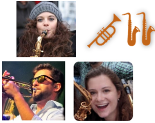
WINDS (0-3 Clips)