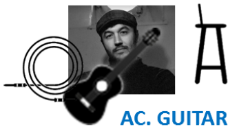
AC. GUITAR L.