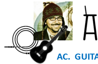
AC. GUITAR R.